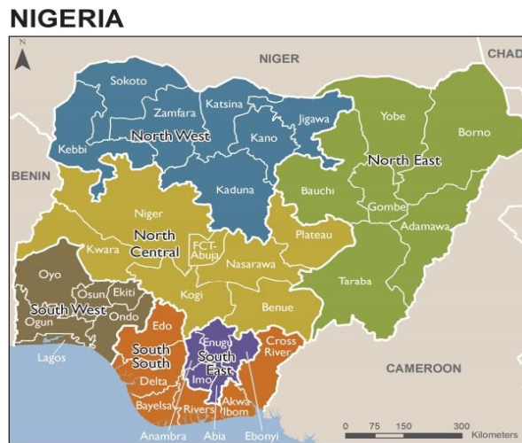
Figure 3 Map of Nigeria

The map of Nigeria, for reference purpose, is as follows: